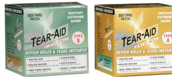
Dimensions: 3.62" x 3.62" x 3.62"