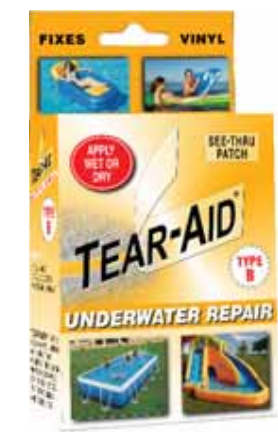
*UNDERWATER REPAIR ORANGE KIT: PATCH TYPE B ENGLISH ONLY