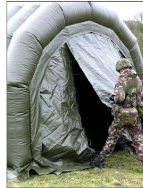
AIRTIGHT VINYL REPAIRS

100 Loose = No Counter Display Kit Dimensions: 3" x 5.5" x 1.25"