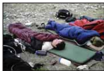
NYLON BAGS & MATS