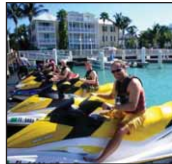
FIX SEATS & COVERS