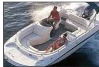
VINYL SEATS & CUSHIONS