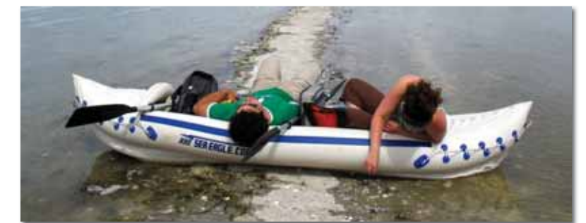
INFLATABLE REPAIRS THAT LAST FOR YEARS

SEE OUR ONLINE SALES VIDEO WITH APPLICATION HINTS