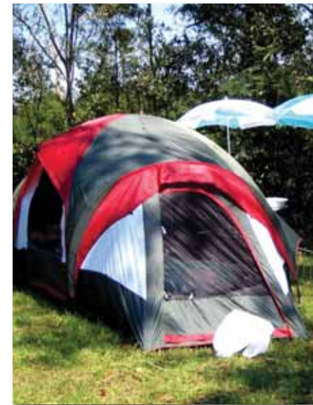
NYLON TENT REPAIRS

PEEL AND STICK SEE-THRU PATCH WITH EXTREME BOND