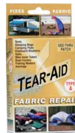
FABRIC REPAIR GOLD KIT: PATCH TYPE A ENGLISH ITALIAN SPANISH FRENCH