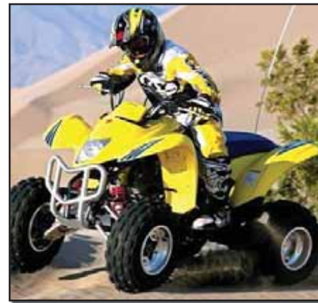
BONDS TO SEATS

TYPE A: ALL FABRICS BUT VINYL TYPE B: FOR VINYL ONLY