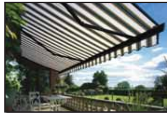
STICKS TO SUNBRELLA

PEEL AND STICK SEE-THRU PATCH WITH EXTREME BOND