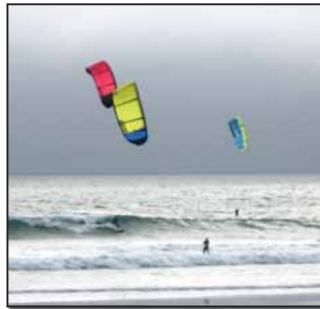
NYLON AND DACRON