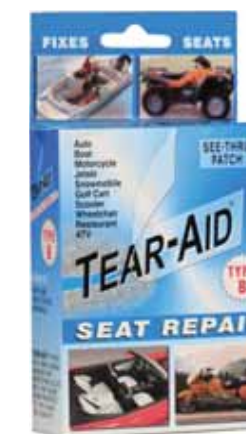
SEAT REPAIR BLUE KIT: PATCH TYPE B ENGLISH ONLY