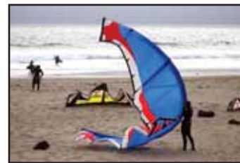
STICKS TO NYLON