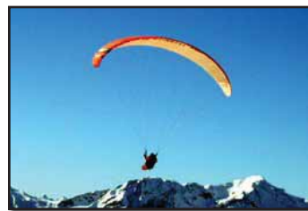
STICKS TO NYLON