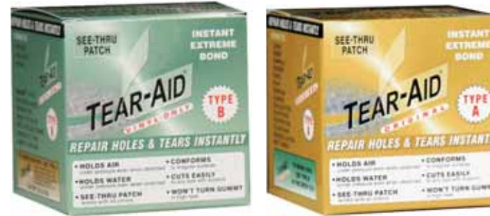
Dimensions: 3.62" x 3.62" x 3.62"