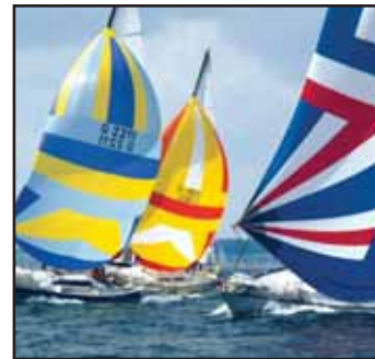
STICKS TO DACRON