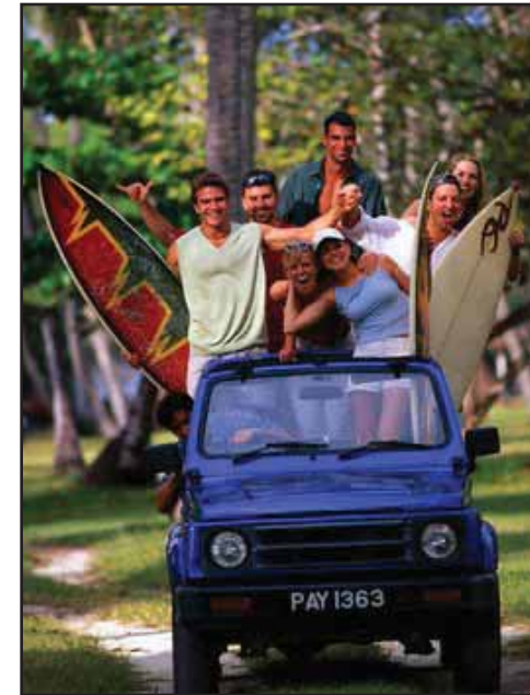
FIX CONVERTIBLE TOPS AND SEATS

100 Loose = No Counter Display Kit Dimensions: 3" x 5.5" x 1.25"