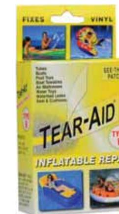
INFLATABLE REPAIR YELLOW KIT: PATCH TYPE B ENGLISH ONLY