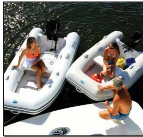
TOUGH INFLATABLE REPAIRS