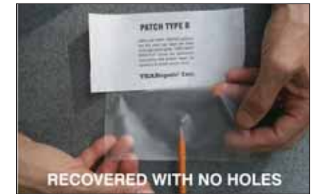
RECOVERED WITH NO HOLES