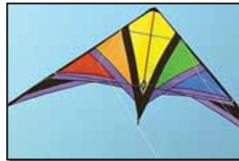
STICKS TO PLASTIC

PEEL AND STICK SEE-THRU PATCH WITH EXTREME BOND