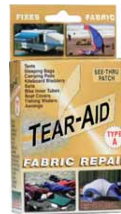
FABRIC REPAIR GOLD KIT: PATCH TYPE A ENGLISH ITALIAN SPANISH FRENCH