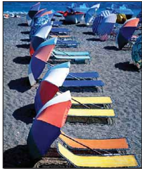
UMBRELLA AND CHAIR REPAIRS