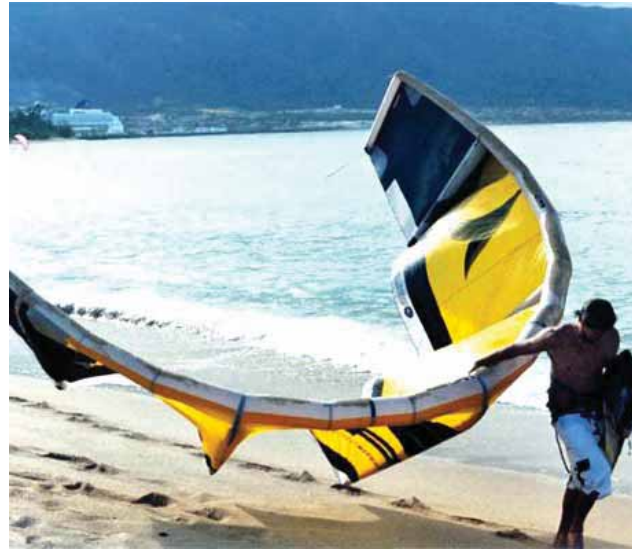
BONDS TO POLYURETHANE KITE BLADDERS