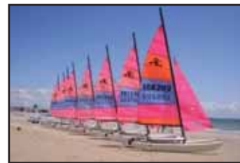
BONDS TO FABRICS