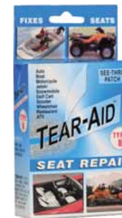
SEAT REPAIR BLUE KIT: PATCH TYPE B ENGLISH ONLY