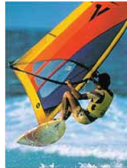
WIND SAIL AND BOARD REPAIR

PEEL AND STICK SEE-THRU PATCH WITH EXTREME BOND