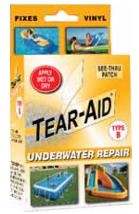
*UNDERWATER REPAIR ORANGE KIT: PATCH TYPE B ENGLISH ONLY