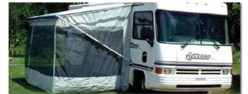
VINYL ROOM REPAIRS THAT LAST FOR YEARS

SEE OUR ONLINE SALES VIDEO WITH APPLICATION HINTS