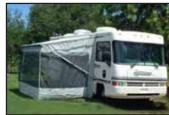
RV ROOM REPAIRS