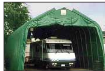
STICKS TO CANVAS