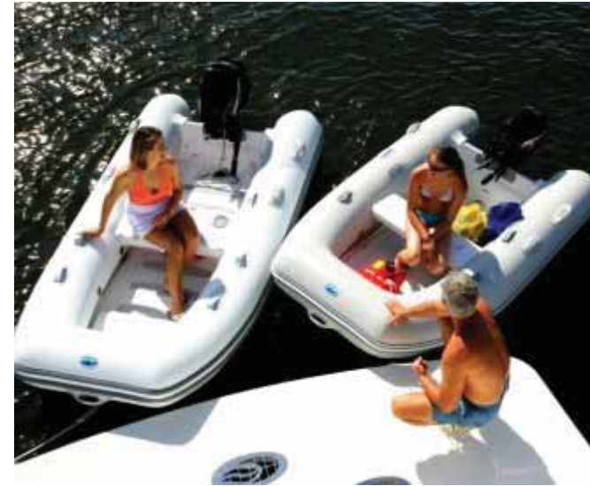
TOUGH INFLATABLE REPAIRS