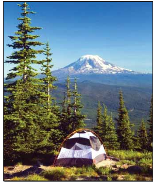
STICKS TO NYLON