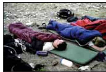
FIX AIR MATTRESS & BAGS