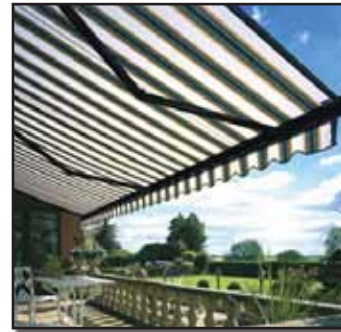
STICKS TO SUNBRELLA