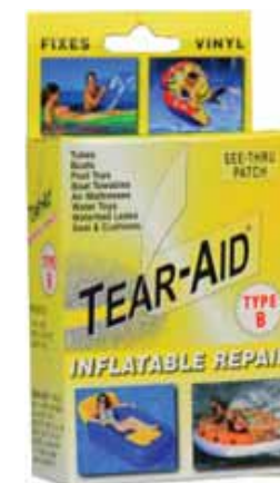
INFLATABLE REPAIR YELLOW KIT: PATCH TYPE B ENGLISH ONLY