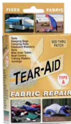
FABRIC REPAIR GOLD KIT: PATCH TYPE A ENGLISH ITALIAN SPANISH FRENCH