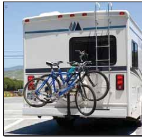
RUBBER BIKE TUBES

TYPE A: ALL FABRICS BUT VINYL TYPE B: FOR VINYL ONLY