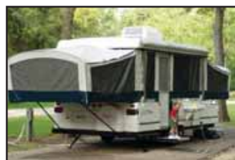
STICKS TO CANVAS