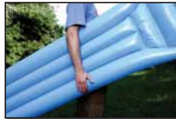
BONDS TO PLASTIC

PEEL AND STICK SEE-THRU PATCH WITH EXTREME BOND