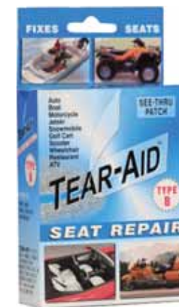
SEAT REPAIR BLUE KIT: PATCH TYPE B ENGLISH ONLY