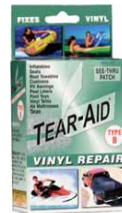
VINYL REPAIR GREEN KIT: PATCH TYPE B ENGLISH ITALIAN SPANISH FRENCH