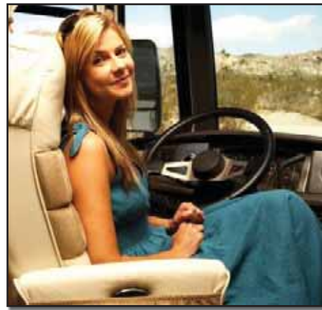
VINYL OR LEATHER SEATS