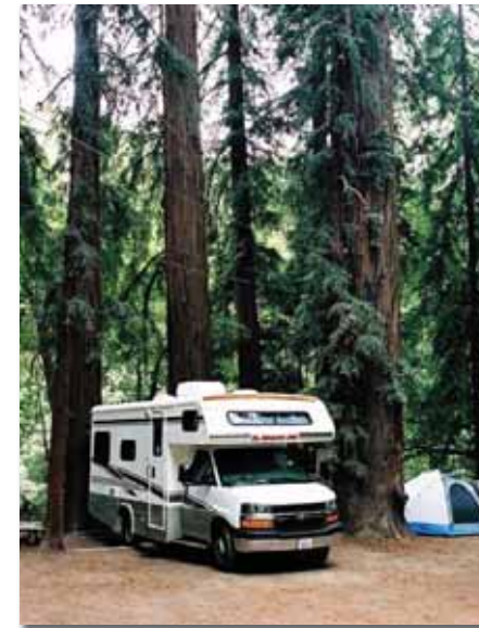
TENT AND AWNING REPAIRS

PEEL AND STICK SEE-THRU PATCH WITH EXTREME BOND