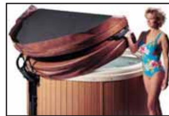
STICKS TO PLASTIC