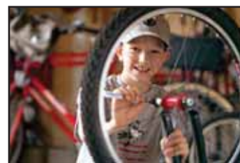
FIXES RUBBER TUBES