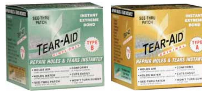
Dimensions: 3.62" x 3.62" x 3.62"