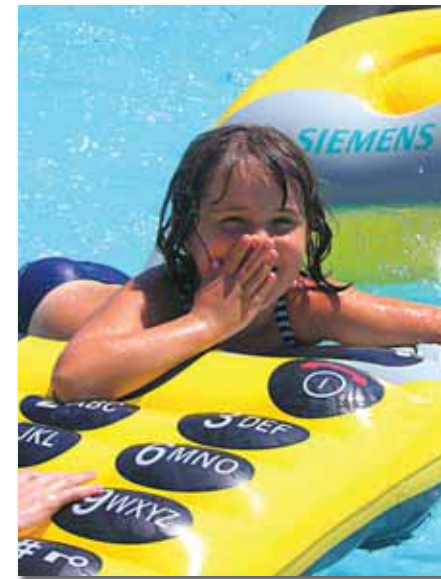
POOL FLOATS REPAIRS

PEEL AND STICK SEE-THRU PATCH WITH EXTREME BOND