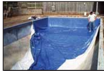
BONDS TO POOL LINERS

PEEL AND STICK SEE-THRU PATCH WITH EXTREME BOND