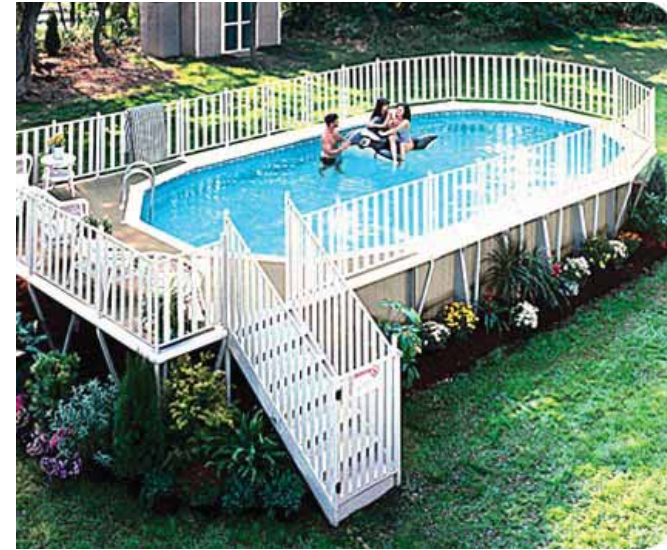
STICKS TO NYLON CUSHIONS