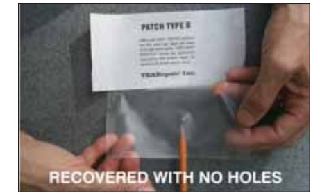
RECOVERED WITH NO HOLES