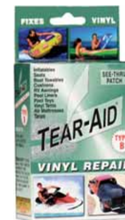
VINYL REPAIR GREEN KIT: PATCH TYPE B ENGLISH ITALIAN SPANISH FRENCH