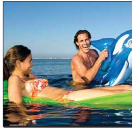
STICKS TO VINYL