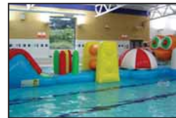
FIX INFLATABLE TOYS