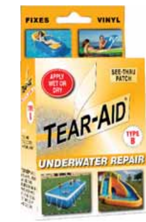
*UNDERWATER REPAIR ORANGE KIT: PATCH TYPE B ENGLISH ONLY