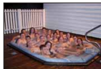
HOT TUB COVERS