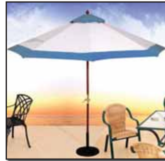
FIX UMBRELLA FABRICS