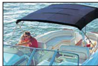
BONDS TO SUNBRELLA