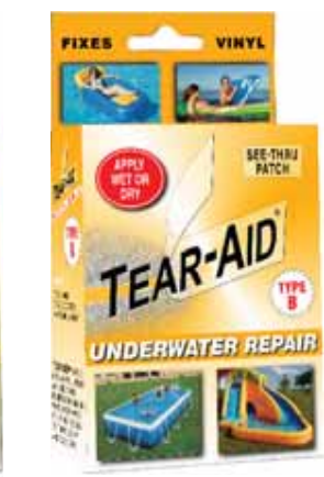
*UNDERWATER REPAIR ORANGE KIT: PATCH TYPE B ENGLISH ONLY