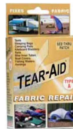
FABRIC REPAIR GOLD KIT: PATCH TYPE A ENGLISH ITALIAN SPANISH FRENCH