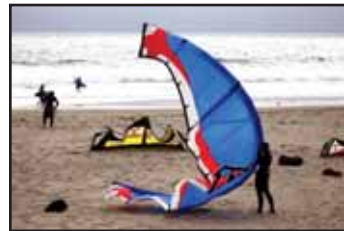
STICKS TO KITE BLADDERS

PEEL AND STICK SEE-THRU PATCH WITH EXTREME BOND