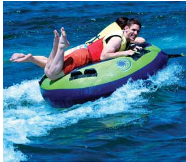
TOUGH ELASTIC INFLATABLE REPAIRS