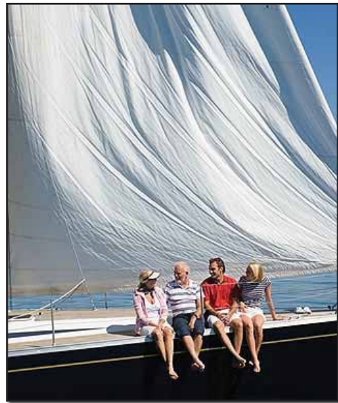
BONDS TO CANVAS