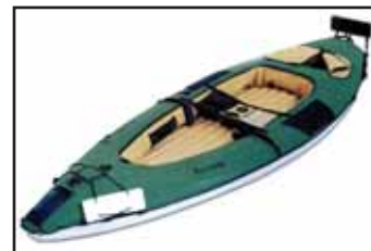
BONDS TO NYLON