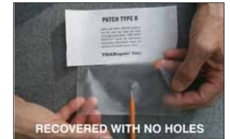
RECOVERED WITH NO HOLES