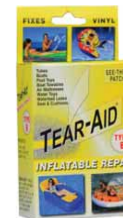
INFLATABLE REPAIR YELLOW KIT: PATCH TYPE B ENGLISH ONLY