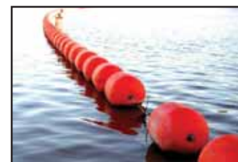
STICKS TO PLASTIC