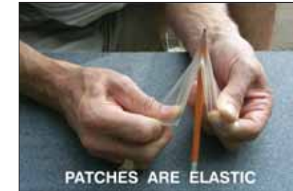
PATCHES ARE ELASTIC