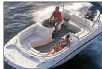
SEATS AND CUSHIONS