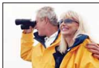
PATCH VINYL GEAR