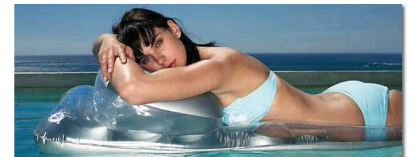
REPAIRS THAT LAST FOR YEARS

SEE OUR ONLINE SALES VIDEO WITH APPLICATION HINTS