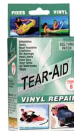
VINYL REPAIR GREEN KIT: PATCH TYPE B ENGLISH ITALIAN SPANISH FRENCH