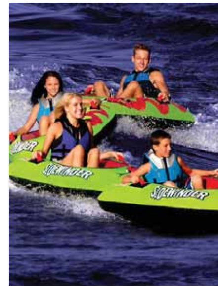
VINYL TOWABLE REPAIRS

PEEL AND STICK SEE-THRU PATCH WITH EXTREME BOND