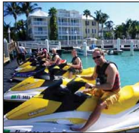
STICKS TO SEATS & COVERS