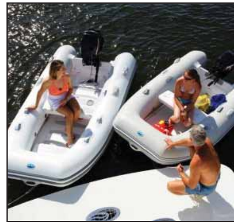
FIX VINYL BOATS

TYPE A: ALL FABRICS BUT VINYL TYPE B: FOR VINYL ONLY