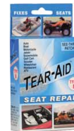
SEAT REPAIR BLUE KIT: PATCH TYPE B ENGLISH ONLY