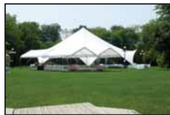
STICKS TO NYLON