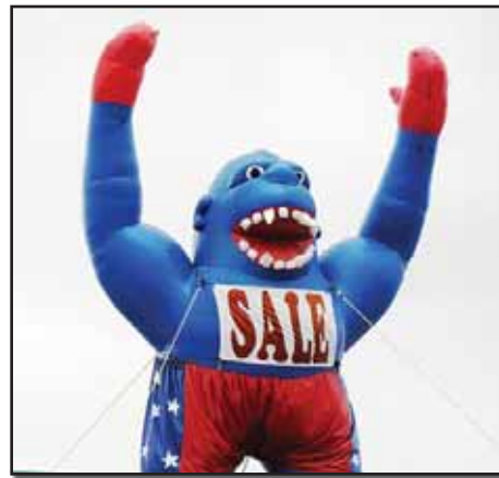
STICKS TO VINYL