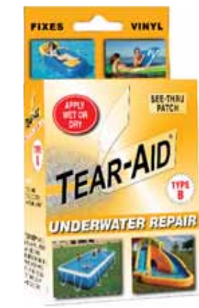
*UNDERWATER REPAIR ORANGE KIT: PATCH TYPE B ENGLISH ONLY