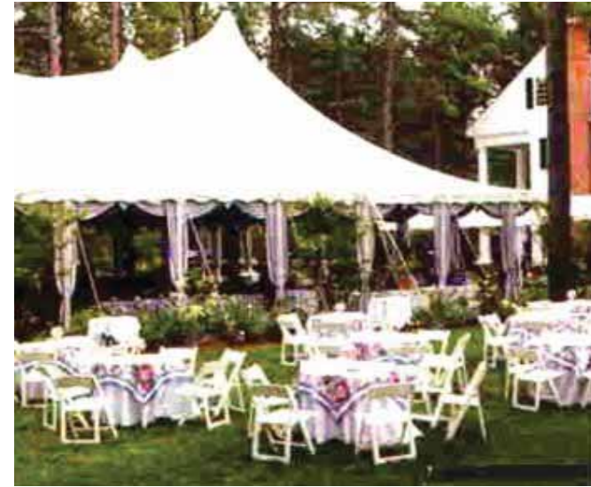
FAST TENT REPAIRS