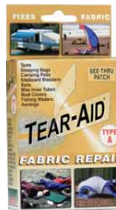
FABRIC REPAIR GOLD KIT: PATCH TYPE A ENGLISH ITALIAN SPANISH FRENCH