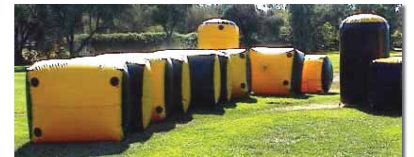
PAINTBALL REPAIRS THAT LAST FOR YEARS

SEE OUR ONLINE SALES VIDEO WITH APPLICATION HINTS