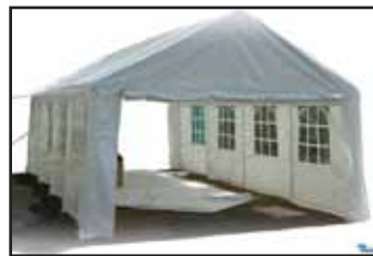
STICKS TO ACRYLICS