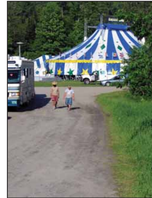
STICKS TO CANVAS