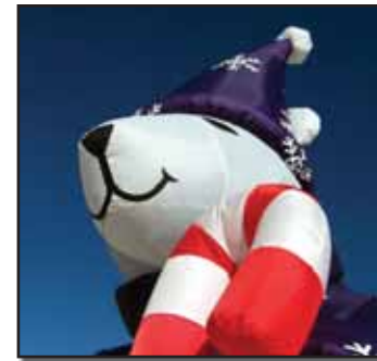
STICKS TO NYLON