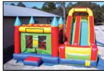
FIX VINYL HOUSES

PEEL AND STICK SEE-THRU PATCH WITH EXTREME BOND