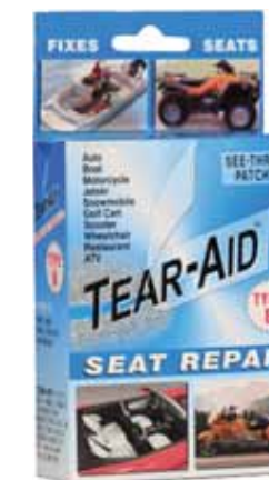
SEAT REPAIR BLUE KIT: PATCH TYPE B ENGLISH ONLY