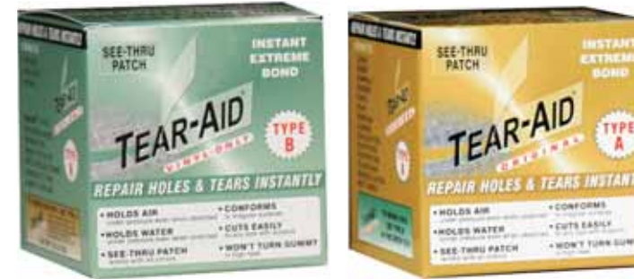
Dimensions: 3.62" x 3.62" x 3.62"