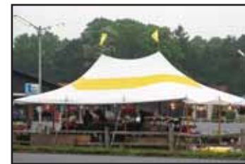
BONDS TO FABRICS