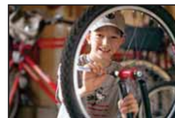
BONDS TO RUBBER TUBES