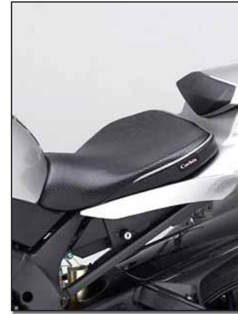
FIXES MOTORCYCLE SEATS

A Standard 20 Kit Case Is All The Same Color