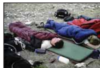
FABRIC MATS AND BAGS