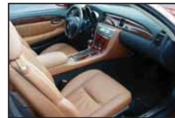
BONDS TO LEATHER