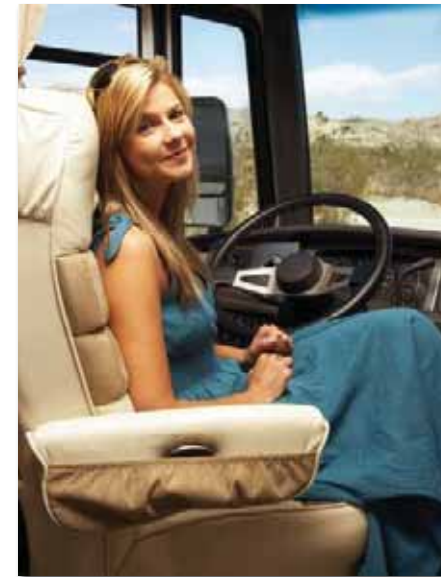
FIX VINYL SEATS

PEEL AND STICK SEE-THRU PATCH WITH EXTREME BOND