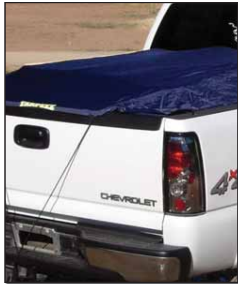
BONDS TO ACRYLICS & PLASTIC