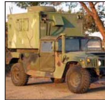
BONDS TO SEATS