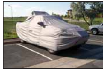
STICKS TO CAR COVERS

PEEL AND STICK SEE-THRU PATCH WITH EXTREME BOND