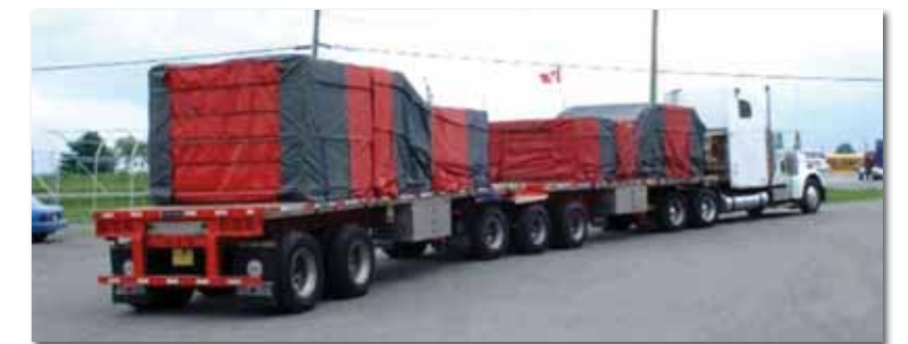
TARP REPAIRS THAT LAST FOR YEARS

SEE OUR ONLINE SALES VIDEO WITH APPLICATION HINTS