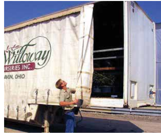
REPAIR SOFTSIDES AND FREEZER CURTAINS